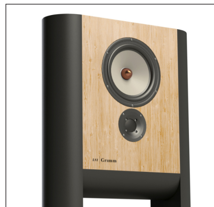
LS1 Natural Bamboo