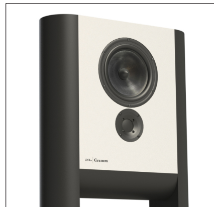
LS1a White lacquer