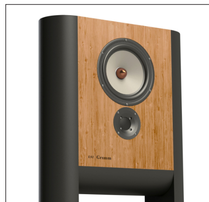
LS1 Caramel Bamboo