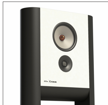
LS1be White Hi-Macs™

5 year limited warranty on material and workmanship.