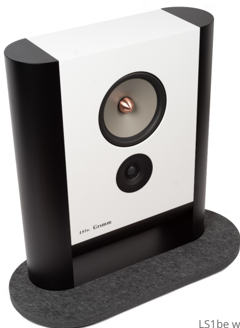
LS1be with Nano legs and acoustic mat

The low system distortion offered by the LS1s will appeal to those who like to listen at higher sound levels and to those who are in search of low distortion in general. As a bonus the LS1s sub can be taken off the footplate and placed in the optimum position for low frequency reproduction, which is not necessarily also the optimum spot for the main loudspeakers. The LS1s is based upon a very high quality Peerless woofer and a 500W Hypex amplifier.